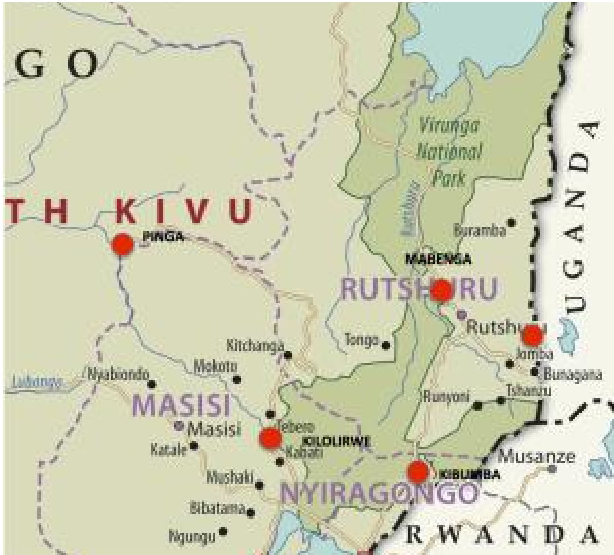
Mweso Health Zone, Masisi Territory, North